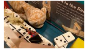
MEWNES LEADS A BATTLE CHARGE