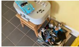
THE GOOD GUY BASE IS TREATING THE WOUNDED