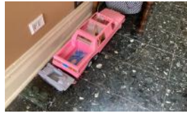
ETHANLISH BATTLE CRUISER LIMO 1 IN HALLWAY