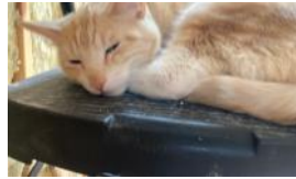
FUZZ HAS BEEN ENJOYING THE WARM WEATHER